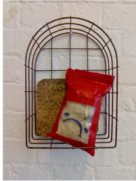
Image 2 Example of sculpture made from found objects