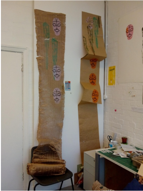
Image 1 Printed Packaging paper attached to wall with Blutak