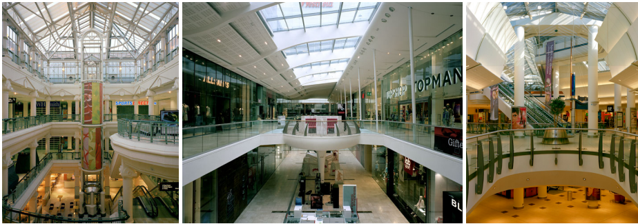
Images (from left to right) Royal Victoria Place 2009, Westfield Derby 2009, Lakeside 2004

architecture from classical antiquity to the post-modern, making newly visible connections, discontinuities and tensions between tradition and modernity.