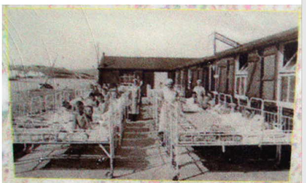
An open air ward.