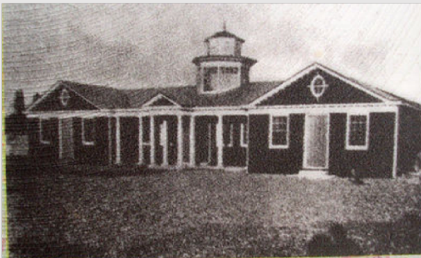
Chailey Heritage Marine Hospital.