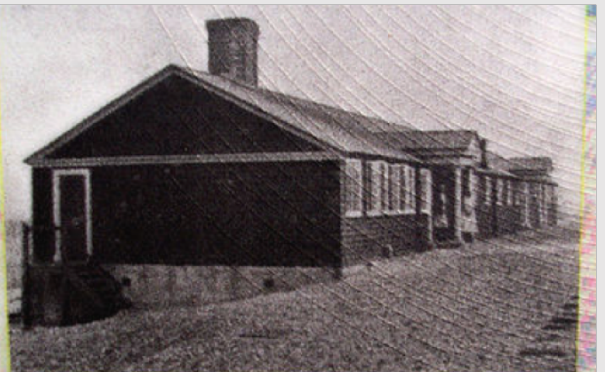
Lily Warren Nurses' Home.