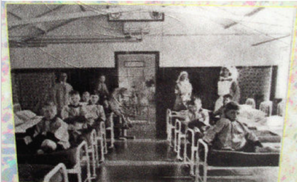
A ward in the hospital.