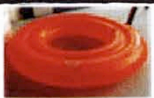
The edge of the ring reminds me of the folds of a baby's skin

Colour was also important to the focus group and was often used to depict emotions / qualities that they would like to pass on such as red for strength