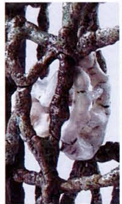
The man with the child in his heart

1 Nature of the Investigation: 'THE FOUND FATHER' I believe that Fatherhood, as well as motherhood should be marked and celebrated. A strong bond between both parents ( of either sex ) has huge benefits for baby, mother, father and society. Fathers need to reclaim the role that was lost to them in the 20 th Century.