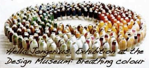
Hella Jongenius. Exhibition at the Design Museum: Breathing colour

8 Colour theory research: colour choices are completely subjective and partial to experience and culture. However interesting to note that babies see black and white tones only for first few weeks. The first colour they see is red