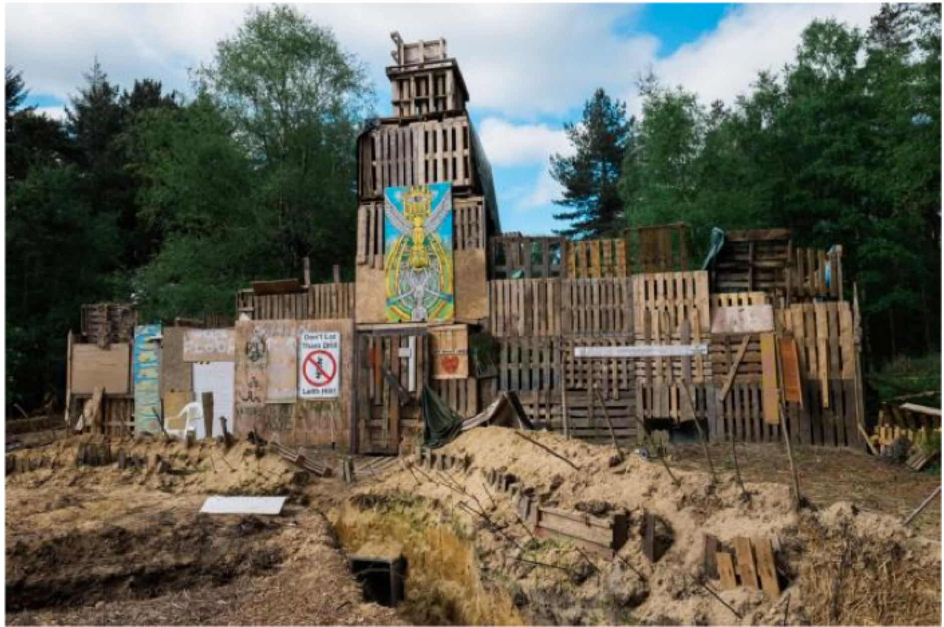
Leith Hill activist camp