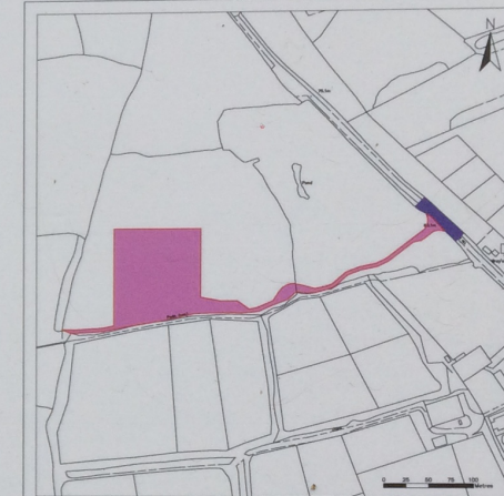
Horse Hill Site Plan

IF YOU COMMIT ANY OF THE ABOVE UNLAWFUL ACTS AND/OR OFFENCES YOU ARE WITHIN THE DESCRIPTION OF THE DEFENDANTS AND ARE BOUND BY THE ORDER, AND MAY BE HELD TO BE IN CONTEMPT OF COURT.